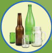
Clean Glass Bottles and Jars